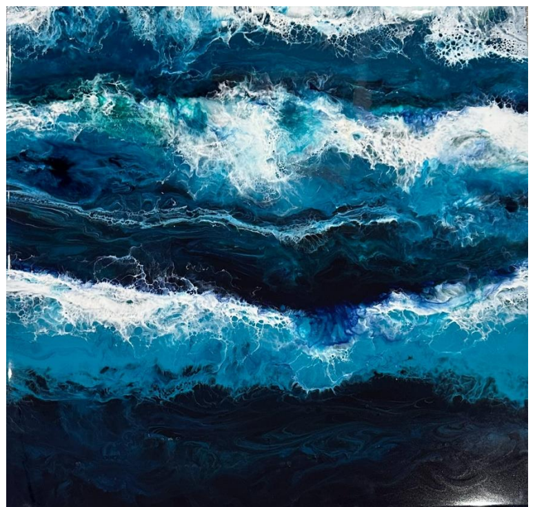
Blue Wonder , by Felicity Kostakis (mixed media)